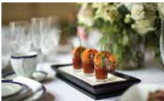
BOSC + BRIE

Please note: The Aladdin Shrine Event Center holds a liquor license. All alcoholic beverages must be ordered through and served by our staff.