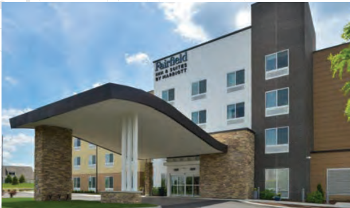
Fairfield Inn & Suites by Marriott