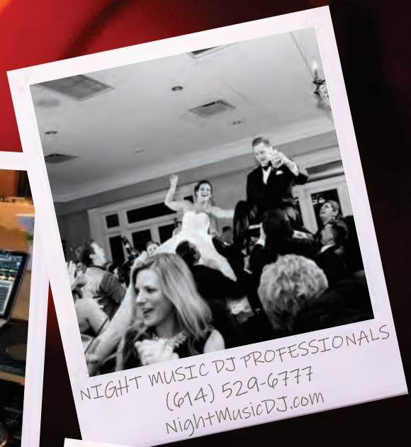
NIGHT MUSIC DJ PROFESSIONALS (614) 529-6777 NightMusicDJ.com