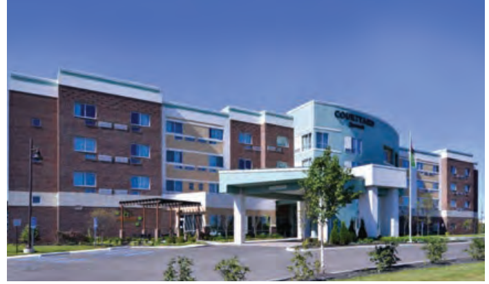
Courtyard by Marriott