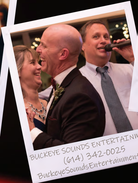
BUCKEYE SOUNDS ENTERTAINMENT (614) 342-0025 BuckeyeSoundsEntertainment.com