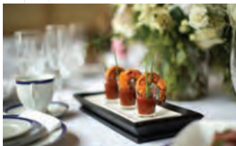
BOSC + BRIE

Please note: The Aladdin Shrine Event Center holds a liquor license. All alcoholic beverages must be ordered through and served by our staff.