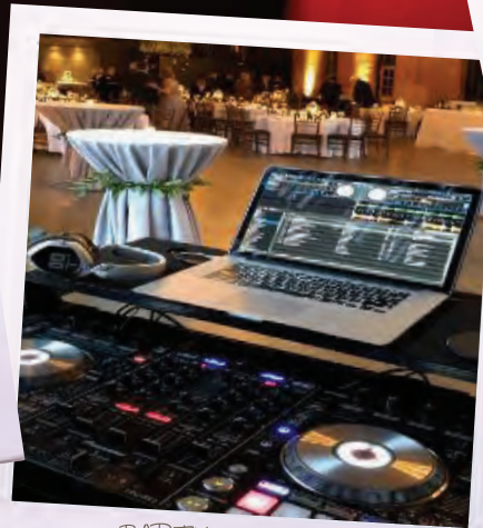
PARTY PLEASERS (614) 396-7017 PartyPleasersServices.com