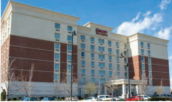
Drury Inn & Suites